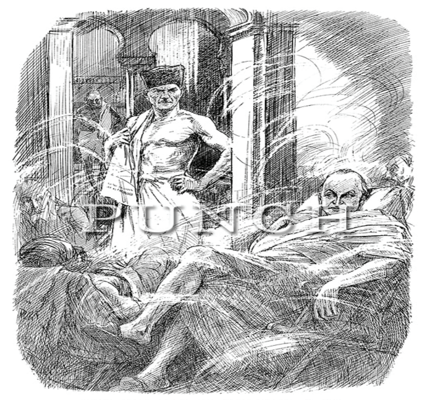
THE TURKISH CONFERENCE BATH. MUSTAPHA KEMAL (Shampooer). "AS SOON AS YOU'VE DONE PERSPIRING, GENTLEMEN, I'M AT YOUR SERVICE."

It can be said that the verbal dimension is based on the themes of "Christianity", "defeat", "exclusion" and "disappointment". The Turkish have been depicted as the animal "turkey" with a play on words. In the visual dimension the figure of the Turkish who is not let in but left to stay out in the cold and in the dark, that is to say in an insecure environment, has been drawn to the right of the picture horizontally. In contrast, it is warm, secure and bright inside. All these contrasting themes like being dead/ alive, outside/ inside, secure/ insecure in the caricature support the basic theme of gullibility of a turkey that is, in fact, not aware of being eaten in the dining hall and that even awaits good-will from the people inside. It is in a negative value context.