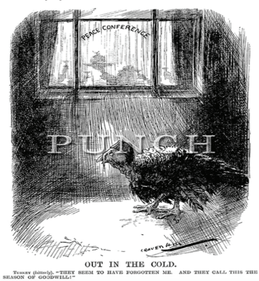
Caricature 5. Out in the cold

of a leader who has to power to run his country. Like the furniture in the room he looks unkempt, untidy and is in great disarray. Though he is a leader who has lost the war and whose authority is at risk, he looks extremely comfortable, pleased and self-confident as if the situation is going to last forever.