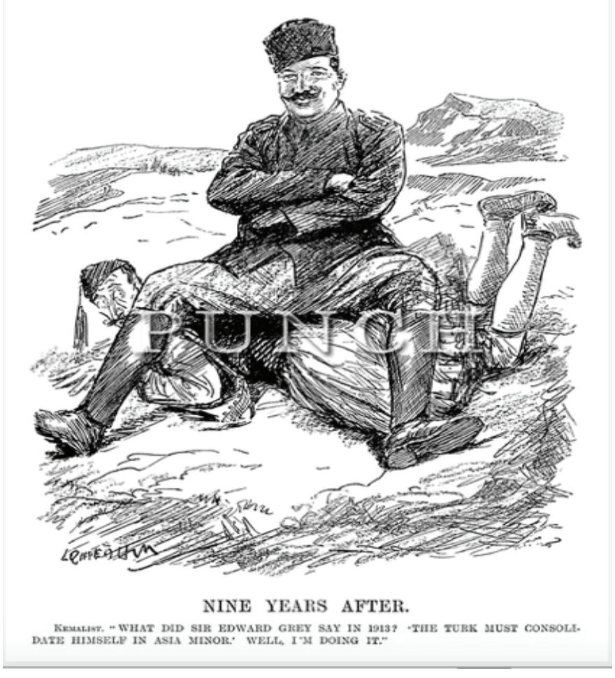
Caricature 2. Nine years after

and bend holding his foot with one hand. The image of the old Turk has been presented with similar themes both in the linear and the verbal dimension of the caricature, and in relation to negative value dimension.