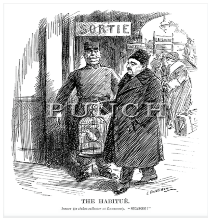
Caricature 3. The habitué

In the visual dimension of the caricature it is seen that the Kemalist in the centre of the picture is placed vertically in comparison to the Greek soldier but horizontally in the composition. The regular and balanced structure consisting of horizontal and vertical line groups in the illustration is attributed to the themes of "decisiveness", "tenacity" and "victory". These themes seem to be associated with positive values in view of the defeated Greek soldier looking bewildered and helpless in the horizontal position.